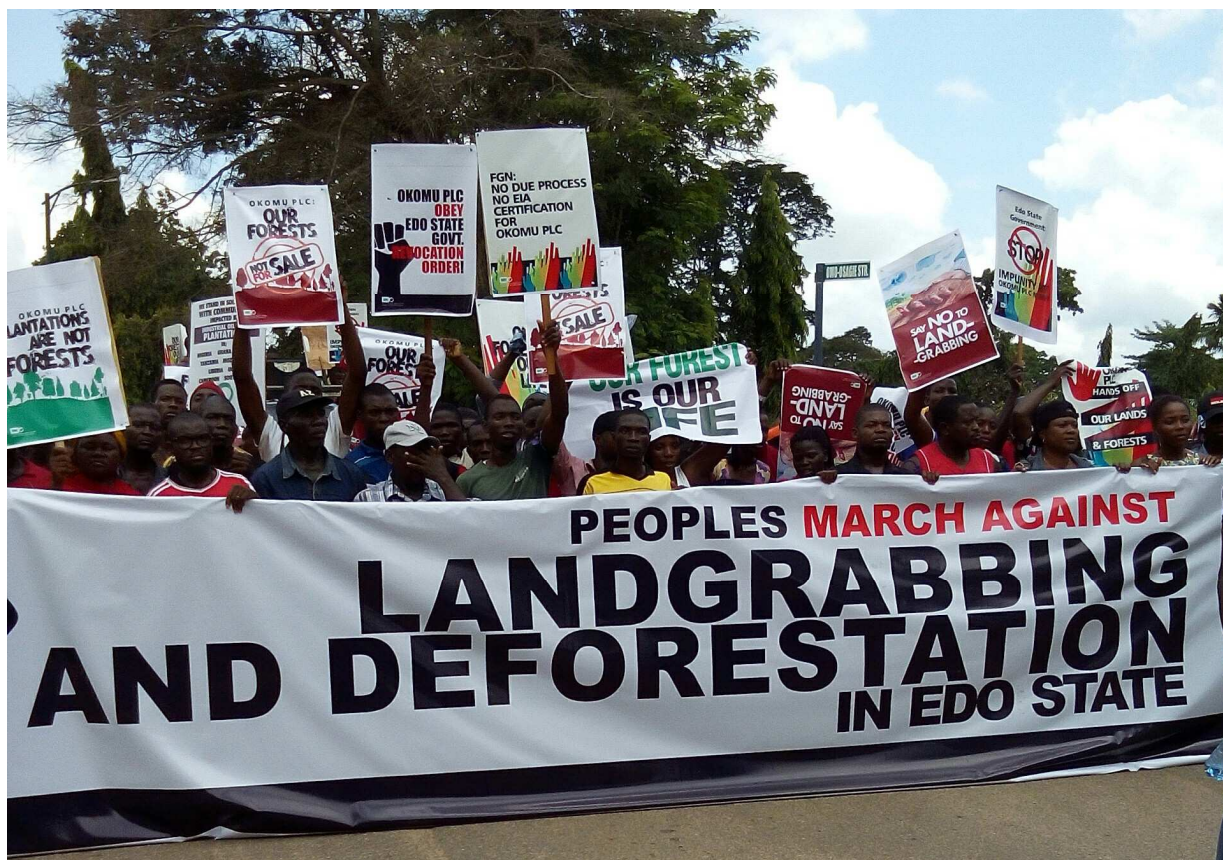
Figure 9. Representatives of the Owan and Okomu communities and civil society urged in June 2017 the administration in Edo State to revoke an order expropriating 13,750 ha in favour of Belgian company Okomu Oil Palm Company. https://ejatlas.org/conflict/oil-palm-plantation