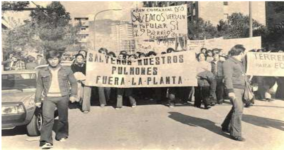
Figure 10. Dismantling the “planta asfáltica” and building the Ateneu Popular, Nou Barris, Barcelona. https://ejatlas.org/conflict/planta-asfaltica-noubarris-barcelona

The rural and urban cases mentioned here and documented in the EJAtlas, are related to metal mining, fossil fuels and climate justice, nuclear energy, industrial pollution, land and biomass grabbing. The banners, murals, slogans, songs, documentaries and theatre performances recorded in the EJAtlas show that many complaints are “glocal” (Swyngedouw, 1997). They have local roots and carry global parallels and implications. There are many links between the conflicts that could be researched in the EJAtlas by network analysis, e.g. the campaign Foil Vedanta is active in Tamil Nadu and London, and has also been active in Zambia and of course in Odisha because of the Niyamgiri Hill case.