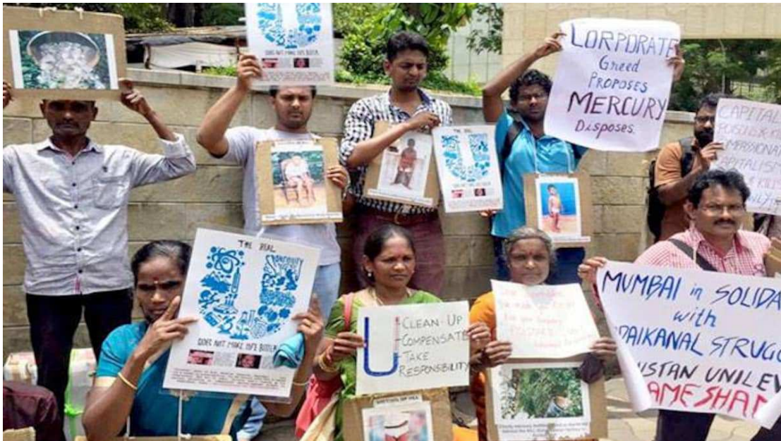
Figure 8. Unilever refused responsibility for Kodaikanal mercury poisoning, India https://ejatlas.org/conflict/hindustan-unilever-thermometer-factory-kodaikanal-tamil-nadu-india