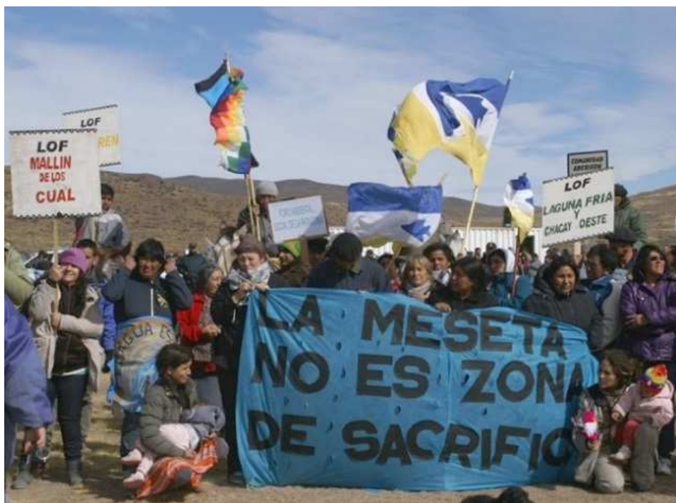
Figure 4. La meseta no es zona de sacrificio. Chubut (No a la mina). Updated by Lucrecia Wagner 2020. https://ejatlas.org/conflict/navidad-mine-of-pan-american-silver-chubut-argentina

The source for Figure 4 is “No a la mina”, initially a local movement and now a well-known webpage in South America born in the Esquel conflict in 2000, where a new institution was born in Argentina, the public anti-mining consultation (imitating Tambo Grande in Peru) (Walter and Urkidi, 2017). Notice also the small banners announcing the two “Lof” taking part in the complaint. Lof is the basic social organization of the Mapuche peoples (in Chile and Argentina), a familial clan or lineage recognizing the authority of a Lonko. Consider now (Figure 5) the banners at the commemoration of Gloria Capitan, shot dead in July 2016 opposing the construction of a coal stockpile as leader of a local anti-coal movement and member of the Philippine Movement for Climate Justice. Katarungan means “justice”. She was 57 years old, one of the leaders of the Coal-Free Bataan Movement and the President of United Citizens of Lucanin Association (Samahan ng Nagkakaisang Mamamayan ng Lucanin), opposing the operation and expansion of coal plants and storage facilities in the Mariveles neighbourhood. Here local collective grievances and complaints were linked to a global call for “climate justice” (coal kills locally and globally).