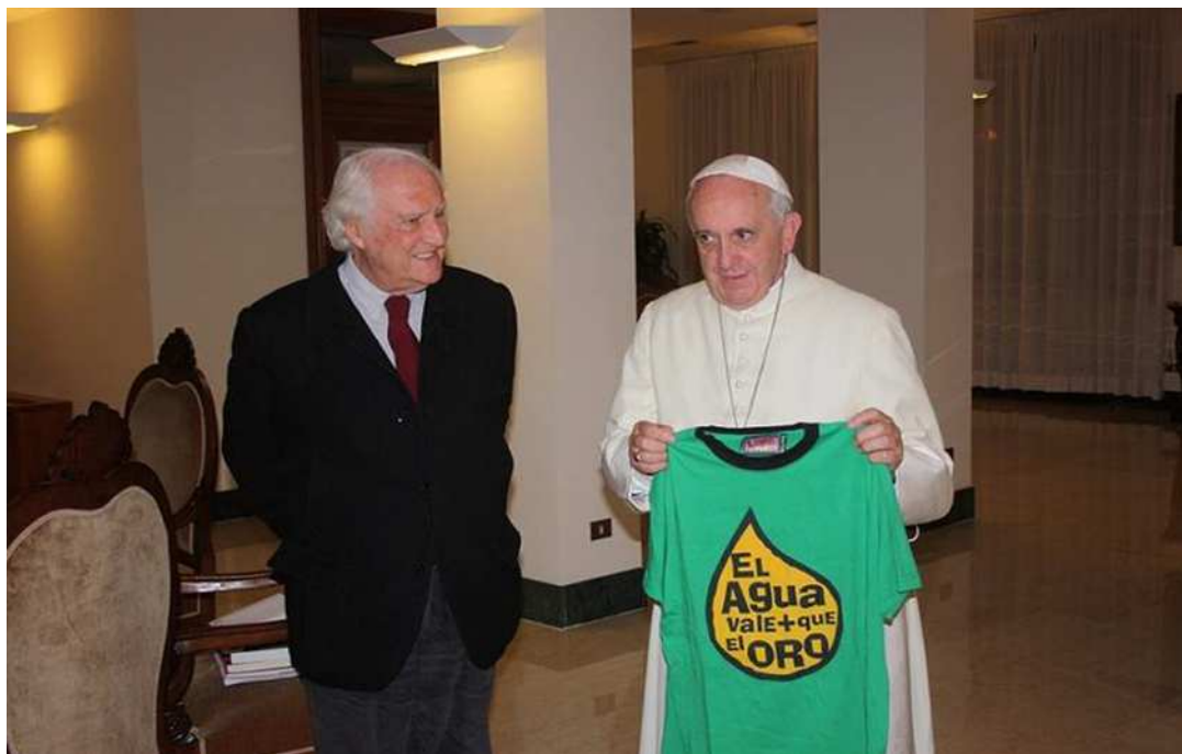
Figure 11. Pope Francis and Senator (and film-maker) Pino Solanas, 2013 (public domain).

Demonstrators using this slogan el agua vale más que el oro ask for the primacy of socio-environmental valuation over chrematistic valuation. People in Tambogrande and Yanacocha (Peru), Esquel and Famatina (Argentina), La Colosa (Tolima, Colombia, against Anglo Gold Ashanti) might think that they themselves invented the slogan. We don't know who did. No organization leader went around bajando la consigna , imposing the mot d'ordre or rallying cry of "water is more valuable than gold". This slogan means that, although one kg of water is far less valuable than one kg of gold on a chrematistic scale, this is not so on other scales of valuation. The slogan accepts a basic tenet of ecological economics: incommensurability of values, long words that most participants in such conflicts would not use. The slogan implicitly asks, who has the power to impose a standard of value over others? It also reveals the common emotions of participants in anti-gold mining movements in Latin America who easily remember the encounter between Pizarro and Atahualpa. The slogan is sung in different styles throughout the subcontinent. Can the subaltern sing? Yes, sometimes. 9